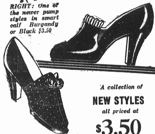
RIGHT: One of the newer pump styles in smart calf Burgandy or Black $3.50

A collection of NEW STYLES all priced at $3.50