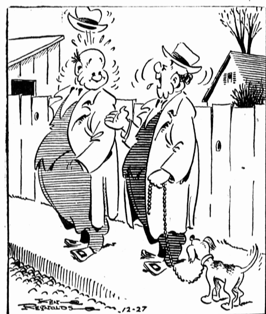
"I got him with a Guardian Want Ad, and is he smart - FOLLOWS me every place I go!"