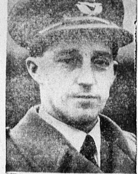
Soccer Star Ace Flier

Seven rinks fell by the wayside as the opening half of the first round of the Wright Trophy curling competition got underway at the Curling Rink yesterday afternoon and last night. This afternoon and this evening at 4, 7 and 8:30 p. m., remaining rinks entered will get into the competition to complete the first round that will leave 16 rinks still in the running for the coveted trophy.