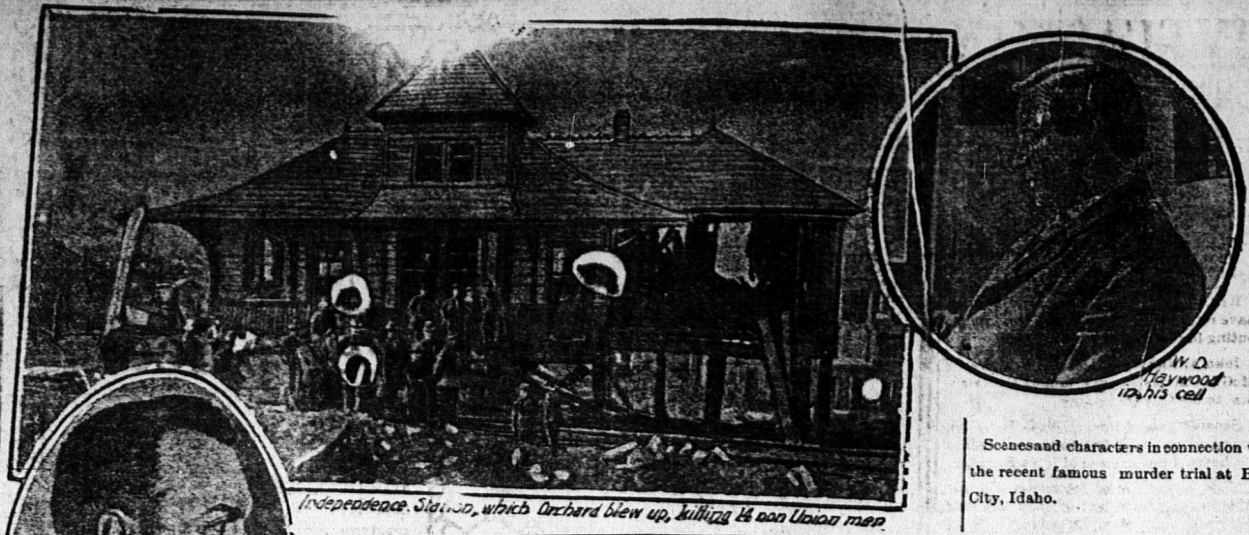
Scenes and characters in connection with the recent famous murder trial at Boise City, Idaho.