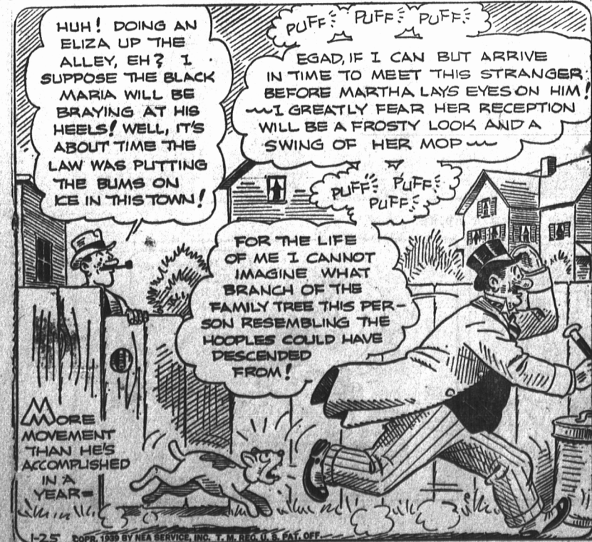
MORE MOVEMENT THAN HE'S ACCOMPLISHED IN A YEAR