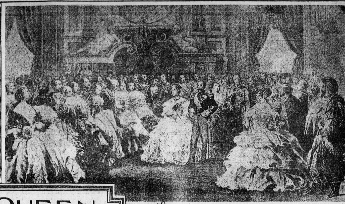
QUEEN VICTORIA AT THE TUILERIES, 1855.