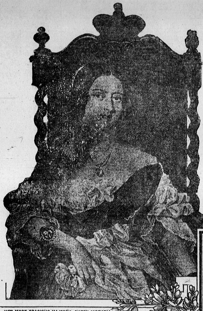
HER MOST GRACIOUS MAJESTY, QUEEN VICTORIA.