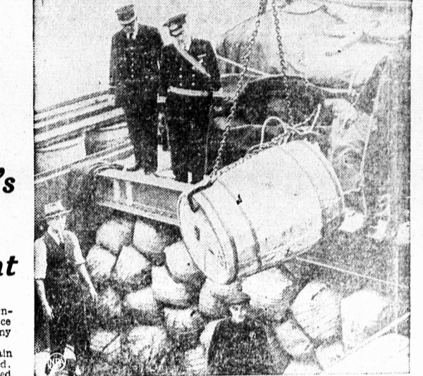
Six famine factors: British blockade stops foodstuffs.

CHICAGO, Aug. 15-(AP)—Wheat prices tumbled about a cent a bushel today, establishing new seasonal lows at levels unequalled here in almost a year.