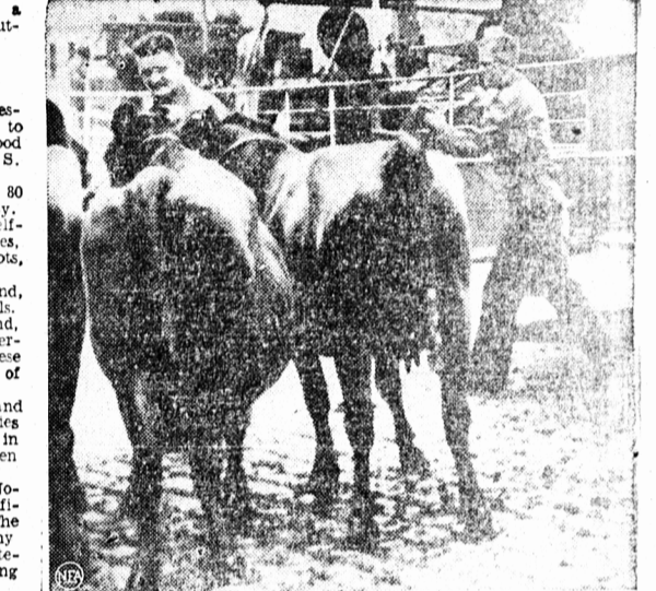
Germany live off and milk countries they invade