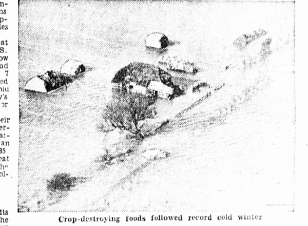
Crop-destroying floods followed record cold winter