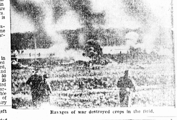
Ravages of war destroyed crops in the field.