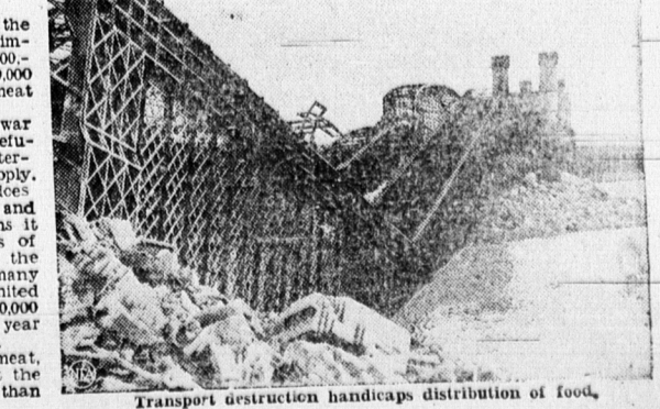
Transport destruction handicaps distribution of food.