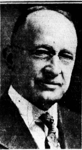
The Conservative Standard Bearer for Prince.