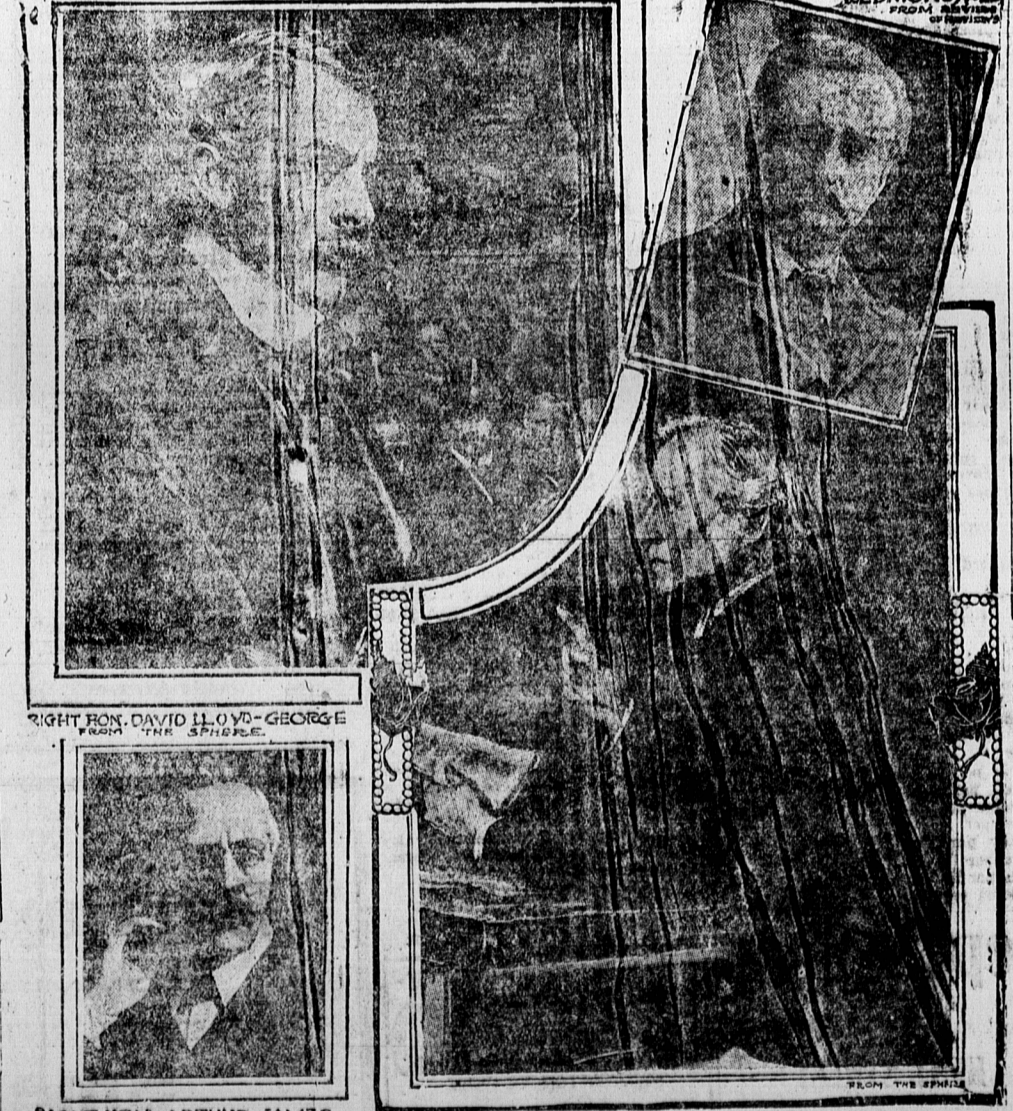
RIGHT HON. DAVID LLOYD GEORGE FROM THE SPEAKER. RIGHT HON. ARTHUR JAMES BALFOUR FROM THE GRAPHIC. Portraits of English Law Makers at present Holding the Centre of the Right Stage in England during the Budget Discussion.

First Aid to Memory. The Coming Poet was being entertained at an afternoon tea given in his honor by the leading society ladies of his native town. It was the Poet's annual home-coming. And leave it to him if he wasn't playing up his transcendental mysticism, or mystic transcendentalism (take your choice) to the awe-inspiring point. Just a few. But, as usual, he was misunderstood. For instance, when he sprang his favorite bromide, "An indefinable something within me often whispers that I have a message to deliver," a dense dame shattered the solemn silence with: "What a labor-saving gift that must be! Why, when I want my husband to deliver a message I always have to tie a string to his finger to remind him of it!"