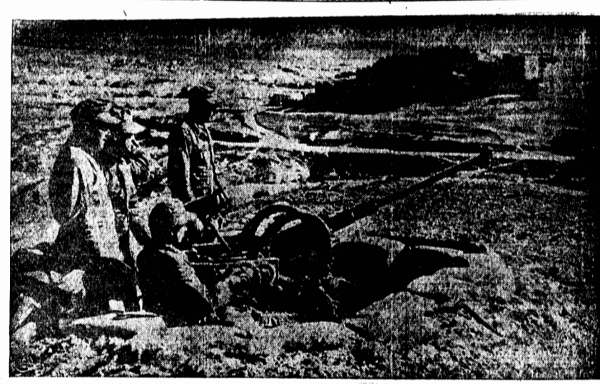
Some of the Nazi doomed to death or "Dunkirk" ground is famous Kasr Ben Khardache. Picture was taken from a Tunisian plain. In background obtained through a neutral source.