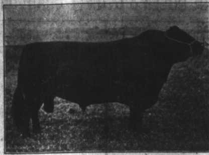
AT THE SHOW—POLLED—ANGUS