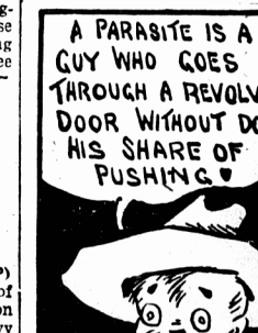
A PARASITE IS A GUY WHO GOES THROUGH A REVOLVING DOOR WITHOUT DOING HIS SHARE OF PUSHING.

Projects planned and under construction will increase the area of irrigated farm land in Canada from about 1,000,000 to more than 3,000,000 acres, a top Canadian irrigation engineer said today.