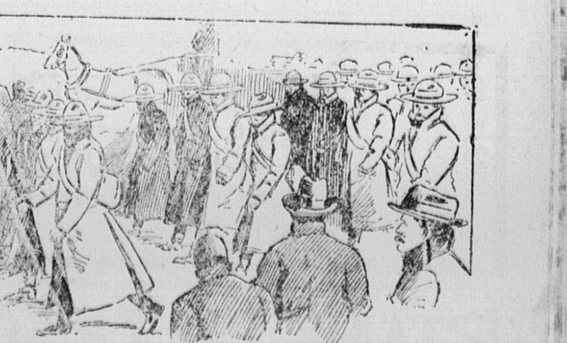
Canadian N.W.M. Police enroute to South African War.