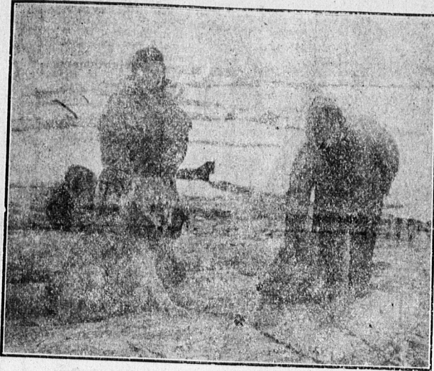
Equimaux of Hudson's Bay.

Succeeding "The Prince Edward Island Magazine" Issued Every Saturday Morning.