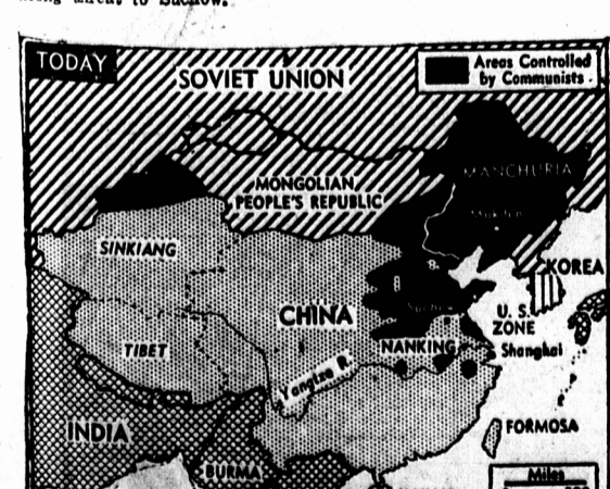
TODAY the Red tide is again at flood level. All Manchuria is in Communist hands. Control of northeastern China is virtually complete. Chiang's future as top man in China is shaky.