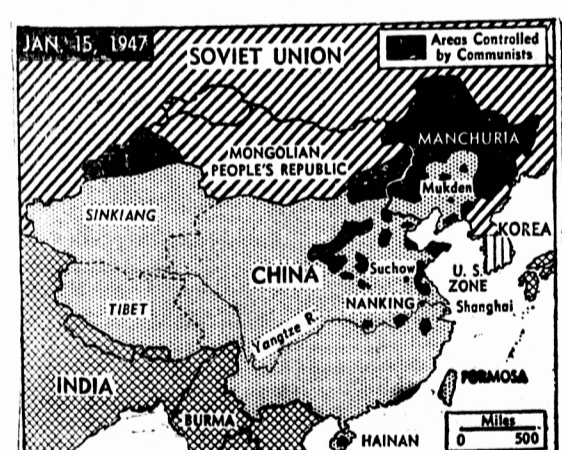
IN 1947 Chiang Kai-shek's Nationalist armies had driven the Reds back somewhat, recapturing much of Manchuria, breaking up their strong threat to Suchow.