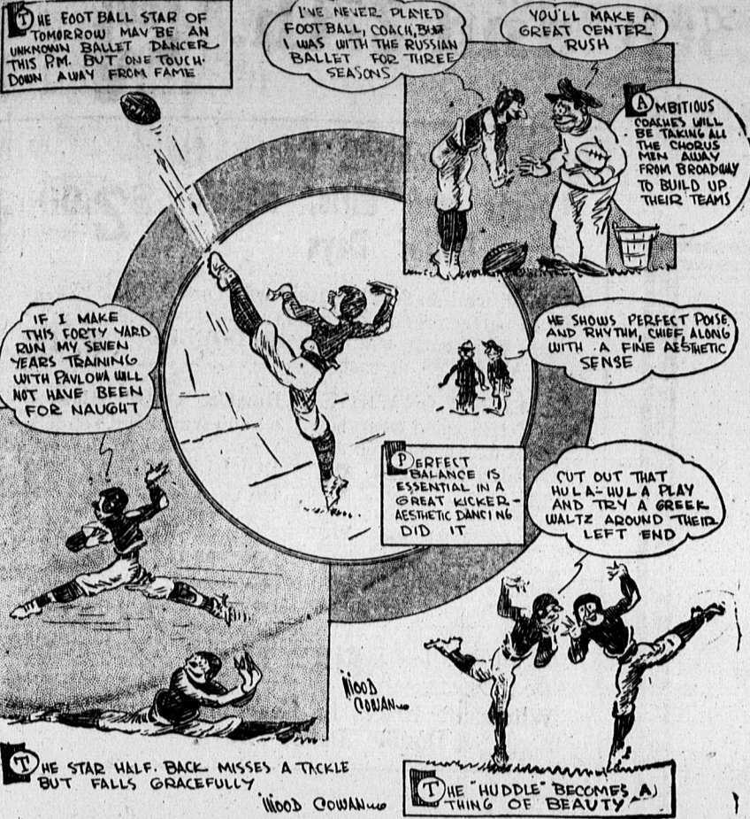
THE STAR HALF BACK MISSES A TACKLE BUT FALLS GRACEFULLY. THE 'Huddle' BECOMES A 'THING OF BEAUTY'.