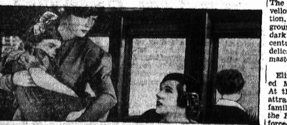
"She's not hungry either. I've found, Nan, that these symptoms mean it's time for a laxative. Give Peggy Castoria tonight."