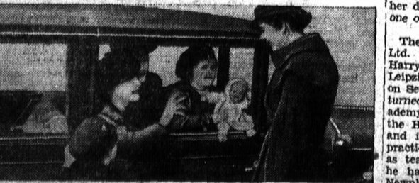
"We want to report that Peggy's fine today — a perfect lamb! We both can't thank you enough for suggesting Castoria."

"A good laxative was all the child needed, Nan. And Castoria is made especially for children. It's the best first-aid treatment for a cold that I know, too. And children never mind taking it because it tastes so good. Then, it hasn't any of the strong drugs in it that make some grown-up laxatives so unpleasant, and sometimes so harmful for children to take."