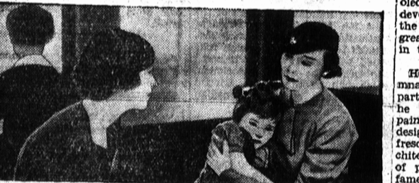
"It's funny, Molly — Peggy's always loved the ride before. But she's been acting just this way for a whole week!"

(Canadian Press) MANCHESTER, Dec. 7.—The Manchester Hippodrome has been purchased by Sidney Bernstein, who will erect on the site a cinema that will seat 2,750, making a link in a chain of 31 cinemas owned by Bernstein.