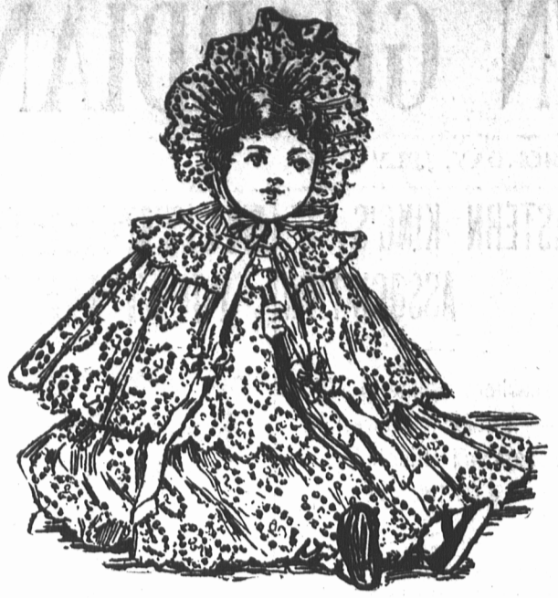
INFANTS PELISSE IN BRODERIE ANGLAISE.

Mark Wright Furnishing Co. CARPETS AND FURNITURE.