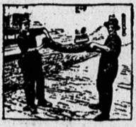
In addition to its toughness and resistance, oxidized linseed oil is health-promoting, it is decidedly germicidal and sanitary. These workers are twisting a section of it.

Most people have observed the filmy substance that gathers over a neglected pot of paint when the lid is removed. This is really oxidized linseed oil, or oil mixed with oxygen. It is tough and rubberlike, yet soft and pliable. When produced in a modern oxidizing plant and added to ground cork and other important oils and gums it brings to linoleum added springiness and toughness. It is decidedly germicidal, the very feature that modern housewives should insist upon when buying a floor covering. This pure product of flaxseed, grown in the Canadian West, is specially compressed and scientifically treated for use in making linoleum.