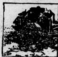
Cork, the bark of the cork oak, native to Spain, yields the soft, spongy surface peculiar to genuine linoleum. It is also tough and enduring.

You have used corks in the home in various ways. Take up one now and squeeze it. It responds to the pressure exerted by your fingers, but once this pressure is released it immediately resumes its former shape. Throw it into a basin of water and it tosses about lightly riding the surface of the water without absorbing a drop. It is entirely non-absorbent. Take a knife and whittle it—its softness is different from that of anything else, and yet, withal it is tough. Is it any wonder that, when finely ground and employed as a primary ingredient of genuine linoleum it retards moisture, ensures a resilient tread, and wears and wears indefinitely?