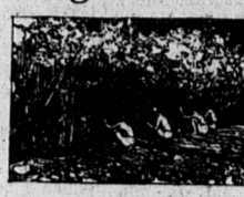
The jute plant attains a height of ten to twelve feet. The native Indian climate, and when cut down, yields long, tough fibres, giving burlap its strength.

Everyone knows why good rope is strong—because of the hundreds of long, tough fibres that are closely and tightly woven together. Burlap, made of similar long fibre jute, grown in India, is used as a base for genuine linoleum and makes a secure, non-tearing ground-work for the cork, oxidized linseed oil and other important materials that are firmly pressed into this backing of burlap. So great is the pressure exerted by the huge rolls employed in the manufacture of linoleum that the linoleum "mix," just described, and the burlap, become as one. If you look closely when buying, you will readily observe this important feature and can then understand why it is so highly important. And more—the burlap used in making Dominion Linoleum and Oilcloth is of the highest quality.