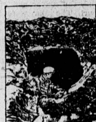
Kauri Gum—the fossilized sap of the pine forests of New Zealand—is used in some instances as an adhesive in the linoleum. It is one of the principal ingredients.

Among the important raw materials used is Kauri Gum—the fossilized sap of the New Zealand pine. This is generally dug out of the ground, as shown in the illustration, and when refined and added to the linoleum surfacing mixture it further enhances its worth. After the plain linoleum is rolled it is cured and seasoned in a large curing room, but when patterned linoleum is desired the design must be printed by passing the goods through huge printing machines which print the pattern automatically before curing. The designs originate, of course, in the designing department, where new and pleasing combinations are being continually evolved, for transfer to the huge printing blocks.