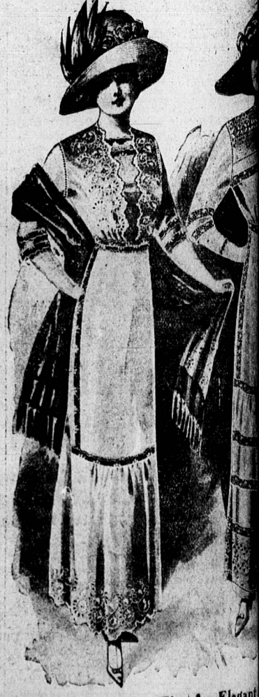
A Dainty Dress At The Price $3.00

Style 148--A neat dress for house wear or summer outings--made in fast color cambrics, finished seams, piped with white, high neck and set in sleeves, best sizes 31 to 40. PRICE $2.35