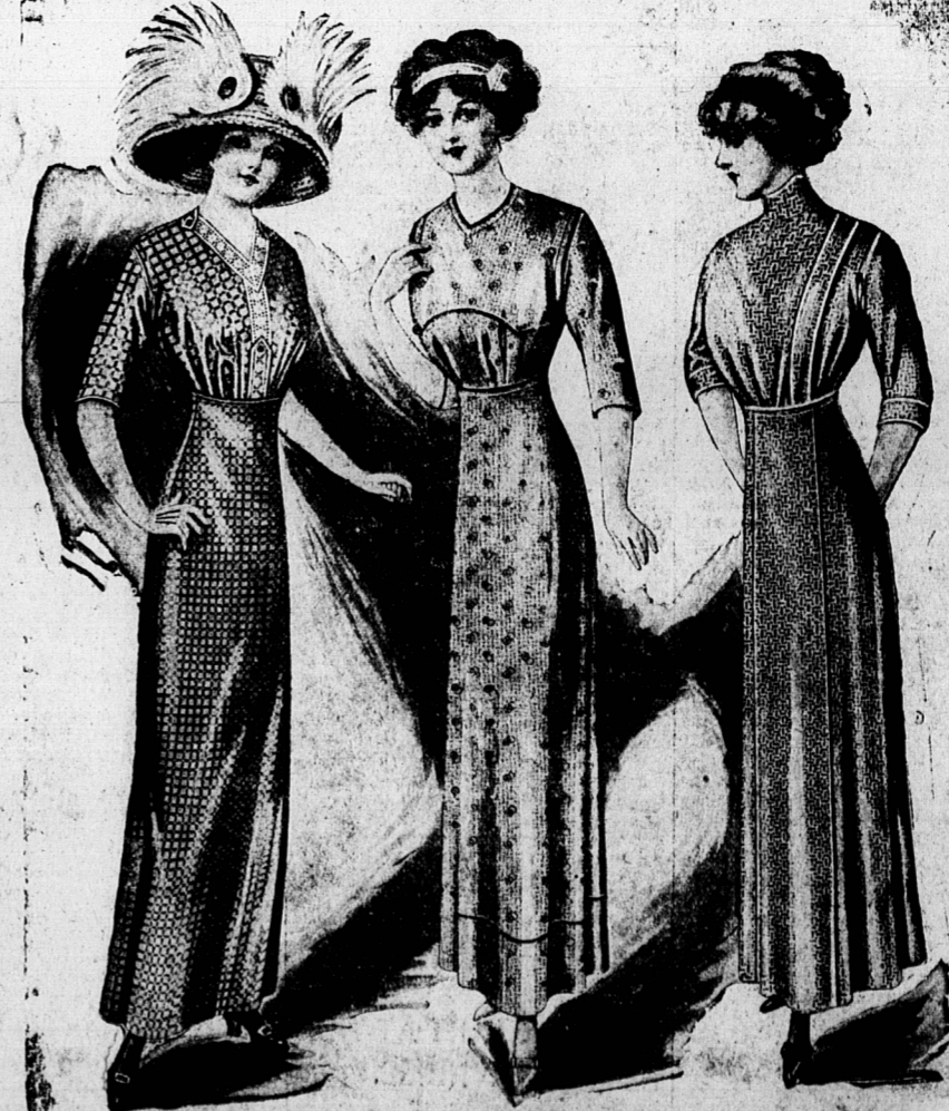
An Attractive Cambric Dress $2.35

Style 4--This is an exceptionally stylish summer dress, as above drawing, made in fast color chambray, trimmed with allover Swiss insertion and piped with plain to match, colors blue and pink stripe, best sizes 34 to 38, and for young ladies 16 and 18 years. PRICE $4.65