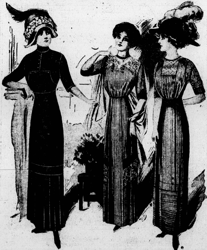
A Neatly Tailored Fine Lawn Dress $4.65

Style 116--This is a neatly tailored dress, as above cut, is made from fine quality lawn, in navy and white, also and white or black and white, piped with white, best sizes 34 to 40. This value will certainly surprise you. PRICE $4.65