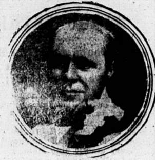
RT. REV. RANDALL DAVIDSON Arch-bishop of Canterbury.