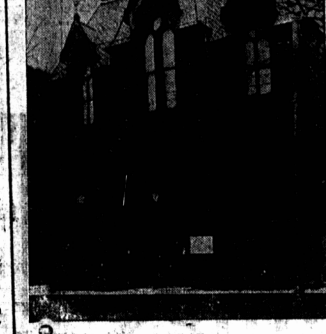
Y. M. C. A. BUILDING.

There are those living in Charlottetown today who have been members from its organization, and a number of other citizens who have stood by the Association through its varied experiences, are still its strongest supporters today. On