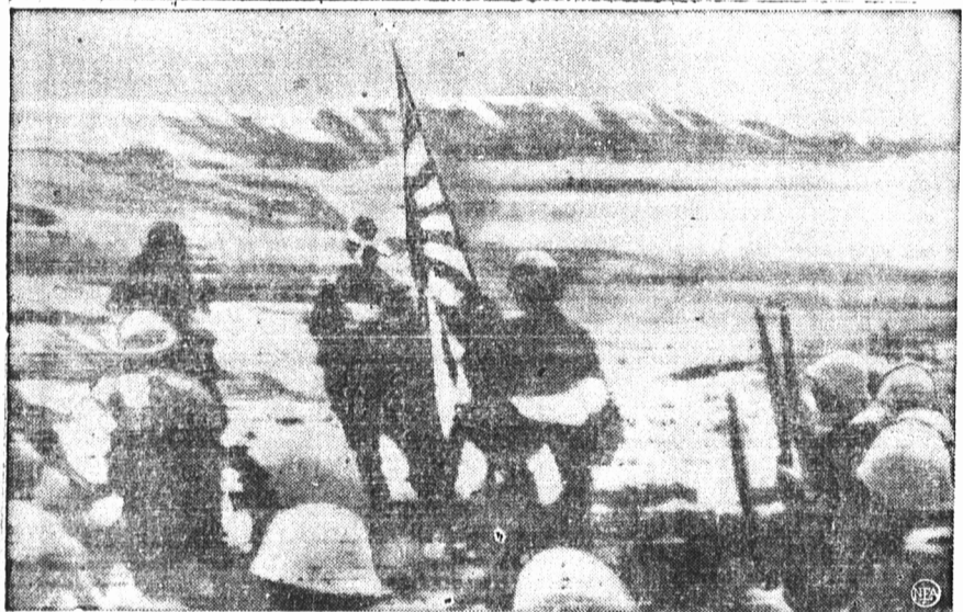
This enemy propaganda photo purportedly shows the Rising Sun being raised by the Japs after their landing on the Aleutian Islands. Photo was just received in New York from neutral Portugal. Lisbon described it as a radiophoto from Tokio to Berlin.