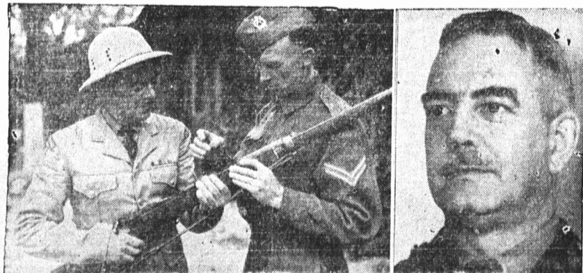
VETERANS GUARD SEEKS 2,500 RECRUITS FOR ACTIVE SERVICE