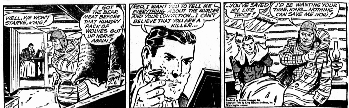
by Zane Grey