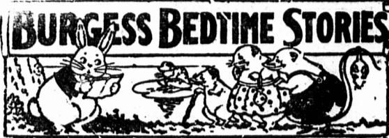
(By Thornton W. Burgess)