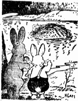
"That's not a house," said he. "It's just a pile of stuff."

This is true of both things that are good and things that are not good. Any one may have too much of anything, and more than enough is too much. Blacky, the pet Rabbit of Farmer Brown's boy, had had enough of the Green Forest. He had had enough of being out in the Great World. He had had enough of looking and listening for he didn't know what. He had had enough of nibbling at food he wasn't used to and so didn't like. He wished mightily that he were safe back in the pen out of which he had dug his way to join his cousin, Peter Rabbit, from the dear Old Briar-patch, to go with him to see the great World.