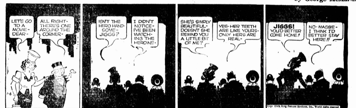
by George McManus