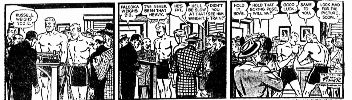
by Ham Fish