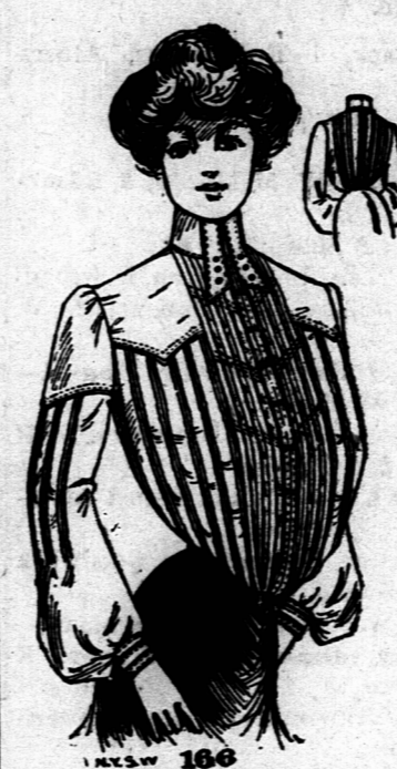
New Flannel Waists.