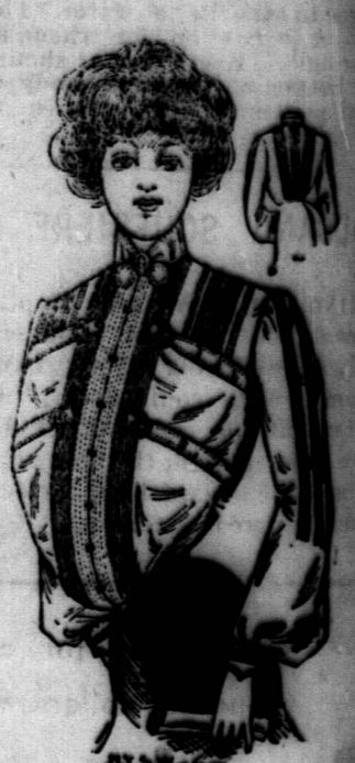
New Flannel Waists.