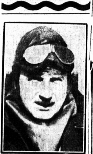
Sir Alan Cobham, famous British airman who flew from London to Australia and back again, and now contemplates another record flight.