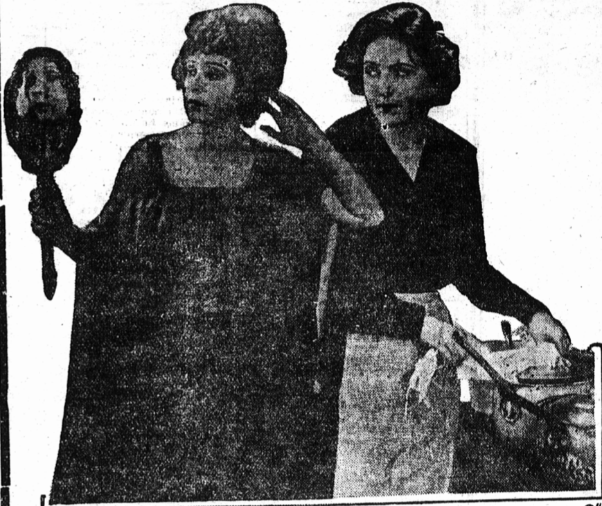
THE TWO NORMA TALMADGES in "YES OR NO"