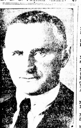
If you've seen the man pictured above, don't tell Adolf Hitler. He's Dr. Karl Goerdeler, former Lord Mayor of Leipzig and pre-war Nazi price director. The Gestapo offers a million marks ($400,000) reward for information leading to his arrest on charges of complicity in the July 20 attempt on the Fuehrer's life.