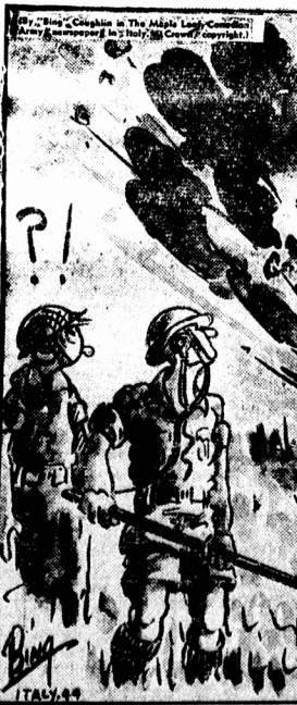
"I told McGuirenot to walk backwards when sweeping."