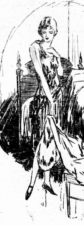
Sally was being elaborately indifferent

Myra was in bed when Sally returned to their stateroom. The evening had been a total loss to her. She put down the book she had been reading to greet Sally, and a vague fear smote her as she saw the look of dreams in her little sister's eyes. "Have a good time?" she asked carelessly. "Where were you?" "Down on C deck near the bow of the boat." Sally was being elaborately indifferent. Myra's appraising glance made her feel uncomfortable. And tonight she didn't want to think or remember anything but the moon and the sea—and Richard Alden. She was putting the fragile black lace over her head when Myra spoke again, very evenly.