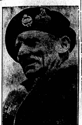
FIELD MARSHAL MONTGOMERY