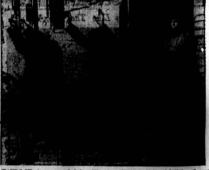
HANDS UP, two captured Axis soldiers march from a battered building, the gun of their captor at their backs. You can help yourself by helping the people of Russia.