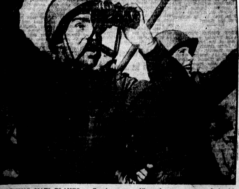
SPOTTING NAZI PLANES, a Russian army officer shouts a command to his anti-aircraft gunners. The German air force on the Russian front has been badly weakened.