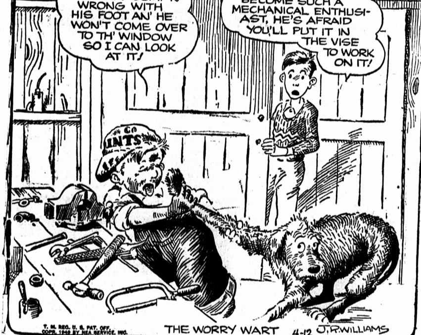
THE WORRY WART 4-12 J.R.WILLIAMS

Before the letters SOS were adopted generally as a distress signal at sea, the letters ODQ were used.