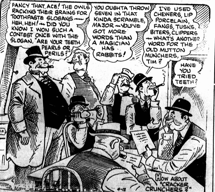
OUR BOARDING HOUSE MAJOR HOOPLE