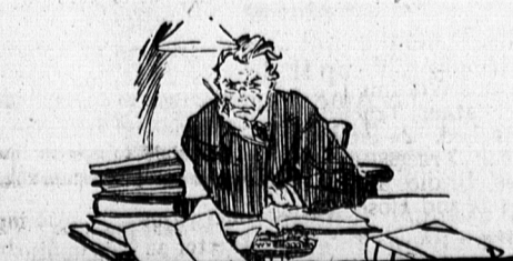
Age 60—Strange how these assets have depreciated! Fifty Dollars a month is good interest on $10,000, and not to be despised.