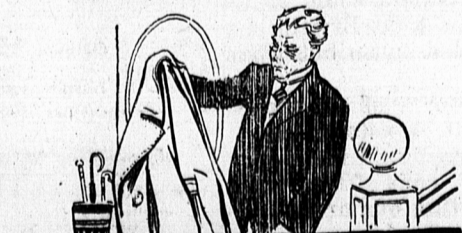
Age 55—He decides it will last another season. "Fifty Dollars is Fifty Dollars."