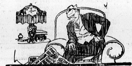
Age 50—Things are not going as well as they were.