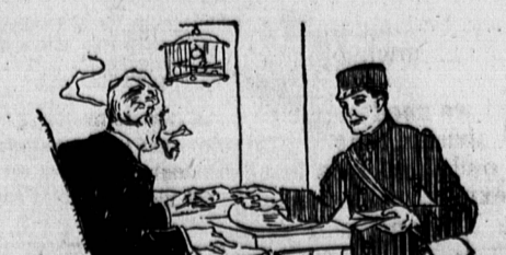
Age 65—He finds Fifty Dollars a month pension, added to what income is left, brings happiness.

You know of men well up in years who are still drudging along. They cannot stop even if they would, but must go on to the end of their days working for a living.