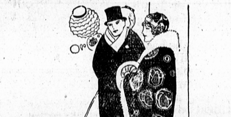
Age 35—This he can easily afford to "spend" Fifty Dollars a month.