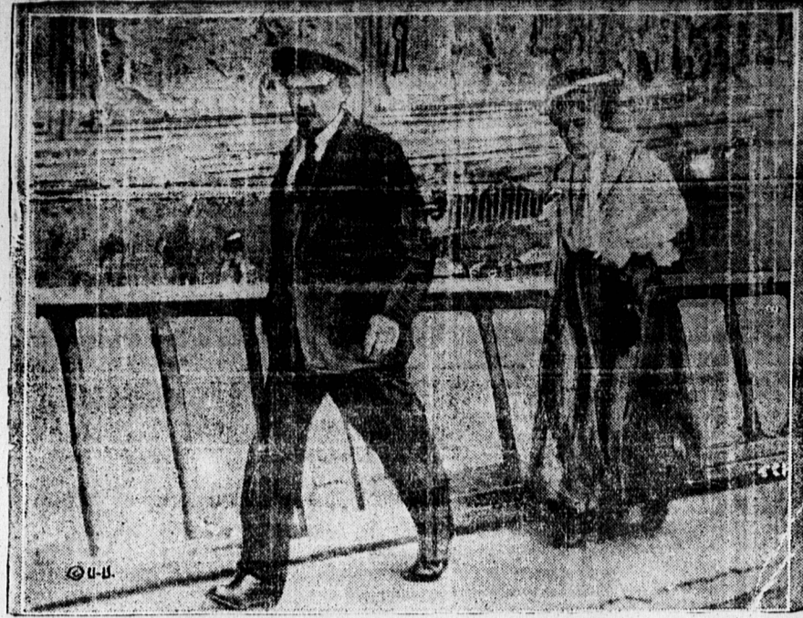
LENIN LEAVING PETROGRAD THEATRE WITH HIS SISTER