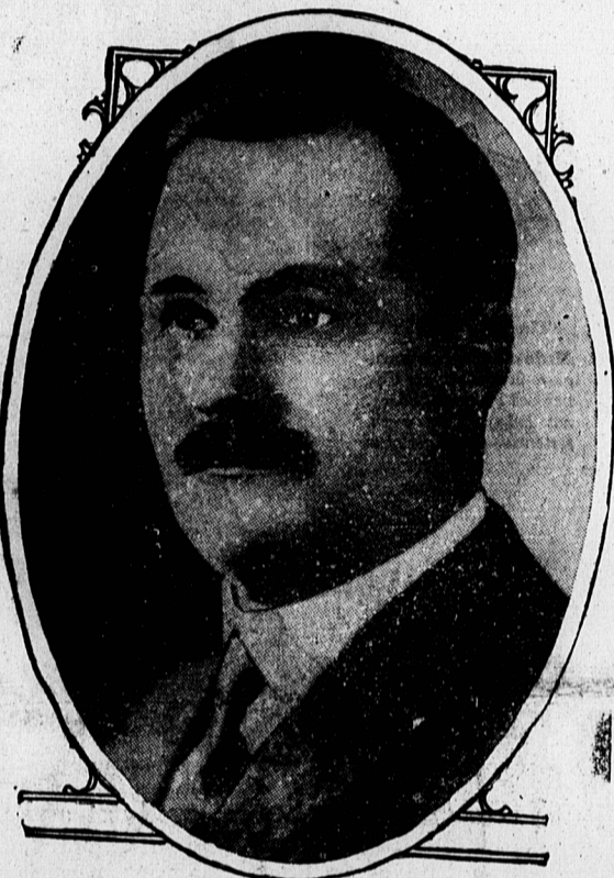
Hon. Charles A. Dunning, whose appointment as the new finance minister for the Dominion was announced by Premier King following a meeting of the cabinet. Mr. Dunning will also continue to administer the affairs of the department of railways and canals as acting minister.