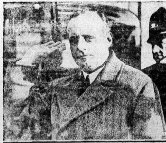
BARON VON RIBBENTROP