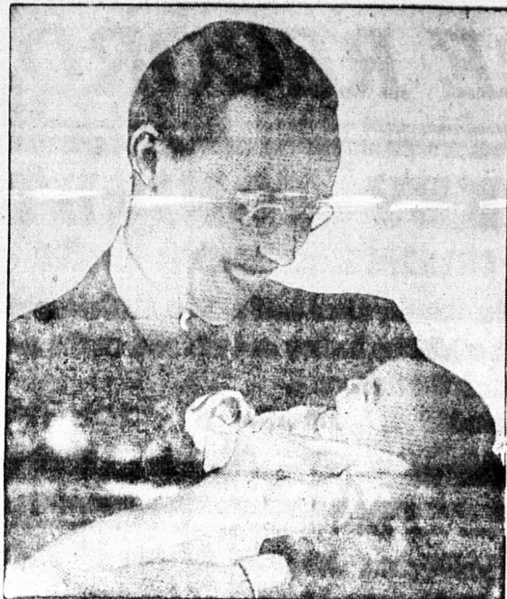
Countesses in Holland are reported considerably disturbed over premature publication of official portraits of Princess Juliana's new-born daughter. When the pictures were taken, an official "rehearsal" was held. Newspapers in The Hague published them earlier. This picture of Prince Bernhard holding his baby daughter was radiated across the Atlantic.