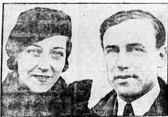
Mrs. Amy Johnson Mollison in London, Monday, Feb. 7, was granted a decree nisi from her flying husband, James Mollison. The two were married in 1929 and flew across the Atlantic together the same year. They spent some time in Canada preparing for a flight from Ontario to Europe. Together and singly they held a number of air records. Mollison did not contest the case. This photo was taken before the marital "crack-up".