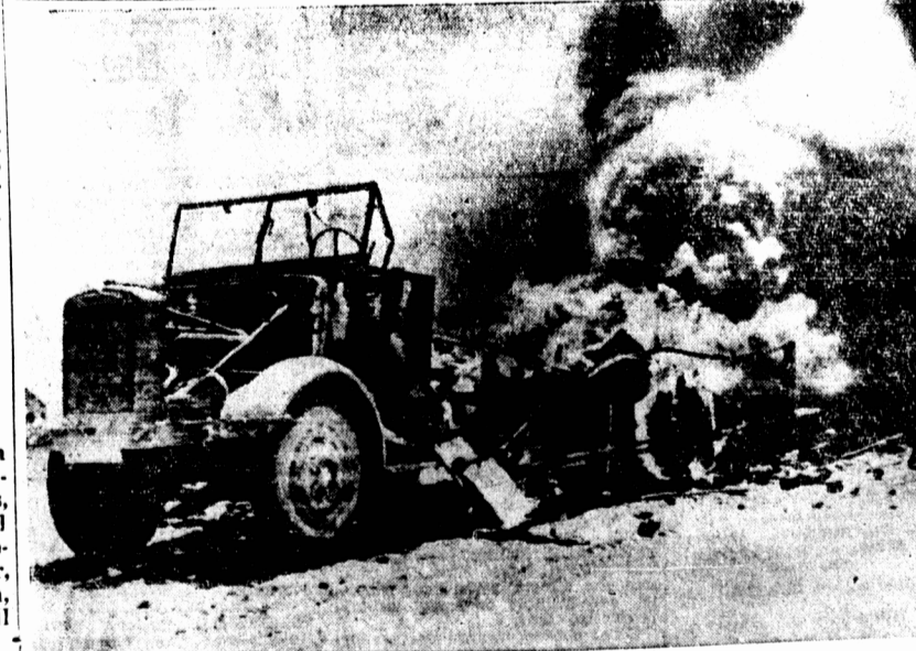
Symbolic of the final axis defeat in North Africa, Nazis in last-minute attempt to destroy their equipment before surrender.