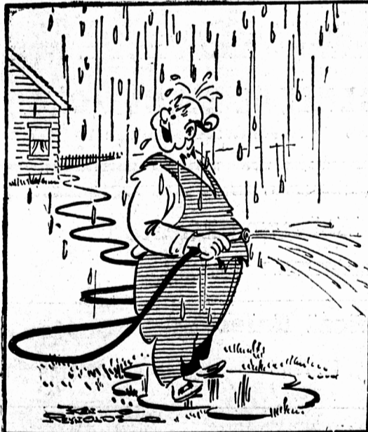
"Don't encourage me — or I'll be selling this garden hose with a Guardian Want Ad!"