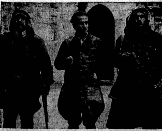
This picture was taken inside Arab headquarters somewhere in Palestine. The physician of the Arab commander-in-chief, Fawzi Bey Kauki, is shown at headquarters flanked by armed guards which Kauki keeps in attendance on him. This same physician was with Kauki when he left Nazi Germany.