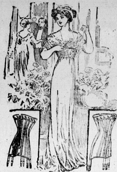
Copyright 1909 Kabo Corset Co. Kabo Style 1000—This model was especially designed to meet the requirements of the strictly up-to-date dresser, being a medium low bust and extra long skirt; having all the graceful curves so essential to the wearer of the style of dress now in vogue—made of good quality fabric with embroidery trim, 12 1/2 inch front class, 3 pair of strong suspenders with hose supporters, white only. Sizes 14 to 20. Price, $3.50

A notable and steady advance has been made in the consumption of