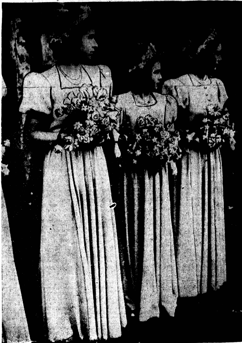
Royal bridesmaids Princess Elizabeth, Princess Alexandra, daughter of Duchess of Kent, and Princess Margaret Rose are shown as they prepare to rejoin bridal procession following wedding of Hon. Patricia Mountbatten and Baron Brabourne at Romsey Abbey.