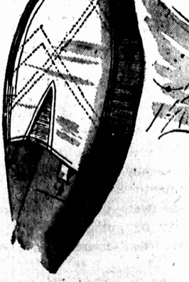
Flexaies® Girdles and Combinations Flexaies® Pulchra Design Bras

Complete figure beauty with the perfect two-piece... figure-sleeking Flexaies for lifeline, lovely lines with blessed freedom... and Flexaie... bra with the clever low cut... in the new Pulchra Design.