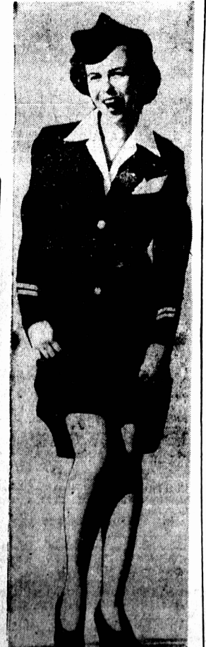
NYLON HOSE PLENTIFUL

Washing down extra dirty walls will only half the work if you use two pots of soda, two cloths—one for the worst film of dirt, one for the second.