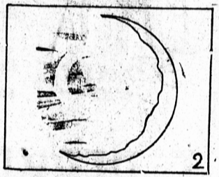
Venus as it appears when near the earth.

Four planets may be seen in the evening sky during December. First, toward the southwest, is the brilliant evening star, Venus by the end of this year is the second brightest object in the heavens. Then, a little to the east of Venus, is the planet Saturn which is still in good position for observation with a small telescope. The earth is elevated nearly fifteen degrees above the rings so that we look down upon them and see them well opened out. To the south, two-thirds of the way up to the zenith is the planet Jupiter, the most striking and brilliant object of the entire sky, and finally, low down in the