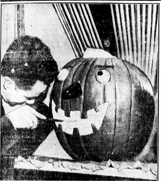
This was an easy shot—one small photo bulb inside the pumpkin, a small and large one in reflectors outside, and a snapshot exposure with high speed film in the camera. Get one like it for Halloween.

HALLOWE'EN is, or should be, a very special occasion for the amateur photographer. Probably none of us would like a steady, year-round diet of weird, grotesque pictures—but for occasional spice and variety, they're fine. And Halloween activities provide plenty of opportunity for such shots. There are, in fact, two kinds of pictures—record shots, covering the Halloween party and the children's costumes; and "stunt" shots, with odd or extraordinary lightings. The best stunt lighting for many Halloween shots is to have your photo lights low—that is, down close to the floor, so that the light shines up into the subject's face. This suggests the lighting you get from a gypsy fire, or a witch's cauldron. Shibboleth shots are also a good Halloween stunt, and taking them can be part of the Halloween party. Just stretch a white sheet over a doorway, illuminate it from behind, and pose the costumed guests in front of it with the room lights turned off. Have two large amateur