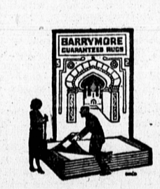
The Rug Salesman will show you the Barrymore Guarantee Label affixed to the back of every Genuine Barrymore Guaranteed Rug.

Designed and Woven by The TORONTO CARPET MFG. CO., Limited Toronto Established 1891 Canada