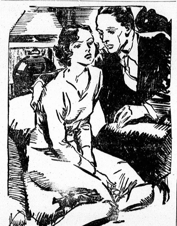
"I'm so s-s-scared," she sobbed. "So terrified Johnny! Something dreadful must have happened to Dad!"

CHAPTER VI Johnny telephoned Alma to learn if she had any news. "Johnny," she whispered shakily over the wire, "come back right away! Some men are here. I can't explain now but—please come quickly." His thoughts were blank as he drove to the Whittaker home, but he was smiling determinedly as he stopped the car in the driveway and walked up the steps, eyeing the