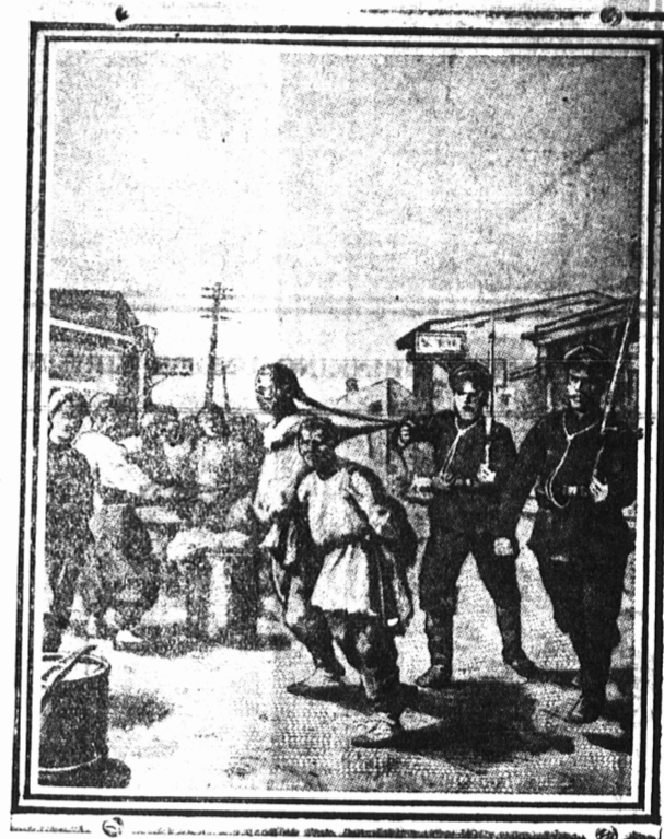
Russians Driving Native Suspects to Camp.