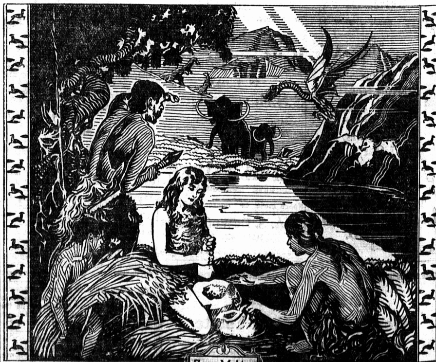
Flour Making Through the Ages