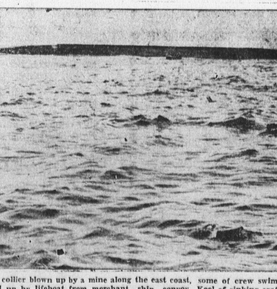
Their collier blown up by a mine along the east coast, some of crew swim for rescue ship as comrades are picked up by lifeboat from merchant ship. Keel of sinking craft is in background.

TELLFORTH, A MARRIED MAN? nics there. You must come over." The homestead, a big, white-painted, rambling one-story place, stood in a large well-kept garden behind vineyards of poplars. Spring buds were coming into bloom in the lower-beds, incisors, the turniture might be very "ordinary" to eyes used to the exotic fancies of ultra-modern interior decorators, but it was unquestionably very comfortable, with its warm carpets and paneled walls, the log-fire burning in the wide hearth, and the trolley laden with bright silver and an array of cakes, scones and biscuits. Mrs. Kane was a plump, cheerful woman, with wavy greying hair, an expensive navy-blue morning-robe, and work-worn hands. She explained that the men were all outside; "Elizabeth of England." "It must be very uncomfortable over at Petersdown—the Crowleys who had it before had so little idea of furnishing, and the dust must be thick all over everything, too." Mrs. Dainty said at once, airily: "My daughter and I are going back to Christchurch to-day. My husband intends to have the house done up for us." That was that. Myrie hoped that they were going to find it as easy to get the house done up as her mother's tone implied. "Oh, really?" Mrs. Kane and Rosemary both looked rather surprised. "We thought you had come up to stay—Evelyn, dear, pass Mrs. Dainty a cake."