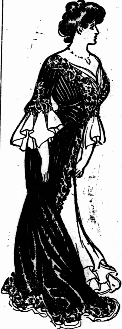
BLACK CREPE DE CHINE DRESS.

FOR EVENING WEAR. Gauze Frock With Chantilly Lace. A Striking Princess Gown. A gauze frock seen recently was in an ivory shade incrustated with large motifs of chantilly lace. The perline of this was composed of finely plaited mousseline and chantilly lace finished by a sky blue waistband. The hat which accompanied this was of white crinoline trimmed with blue ostrich feathers. A striking evening gown seen recently was cut princess, with a triple skirt of black tulle and an overdress arranged in long points of jet paillettes softened by a berth of black mousseline de sole incrustated with sequined flowers. The loose hanging sleeves were of black tulle studded with paillettes and bordered with black chantilly lace. White and green and white and rose are combinations much in evidence