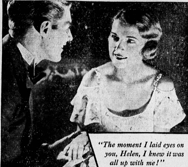
"The moment I laid eyes on you, Helen, I knew it was all up with me!"

CALAY... "THE SOAP OF BEAUTIFUL WOMEN" ... CAN HELP YOU TO WIN