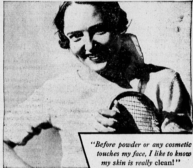
"Before powder or any cosmetic touches my face, I like to know my skin is really clean!"

Costly clothes and rouge are little use to the girl with a bad skin. Put your trust only in the finest soap there is—Calay. Let it clear away the greyish film that spoils the complexion.