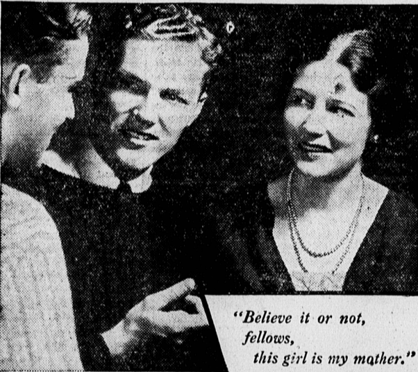
"Believe it or not, fellows, this girl is my mother."

In the end, a man always turns to sweet, natural loveliness. The pure, clear-complexioned girl wins his love and holds it. He'd go to the ends of the earth for a girl like that.