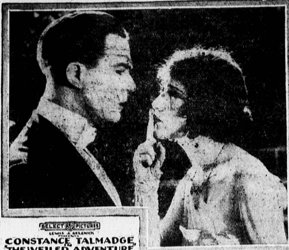
CONSTANCE TALMADGE THE VEILED ADVENTURE