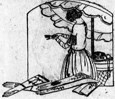
SMART GOWNS FOR AUTUMN